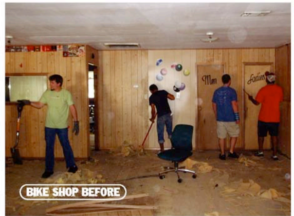
BIKE SHOP BEFORE

looking forward to all the great things to come at the new campus, and hope you will join us in making it a truly vibrant and uplifting center for the community.